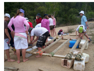
Building a raft at the 07 Regatta at Loam Island.

To Survive we rely heavily on parent support.